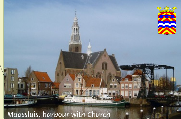
Maassluis, harbour with Church

In the “Westland” greenhouse farming is one of the most important economic activities.