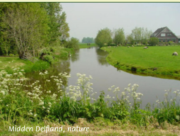
Midden Delfland, nature

In the immediate vicinity of Maassluis there is also a magnificent age-old polder landscape, an area of outstanding natural beauty.